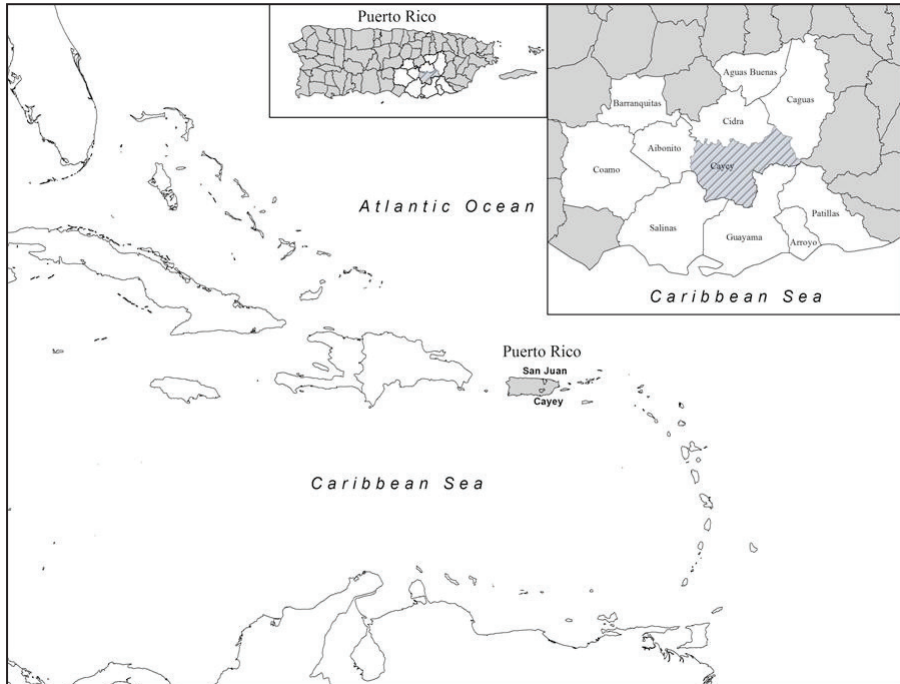
Figure 1. UPR - C catchment area and geographical profile

at UPR-C has increased 5.39% from 3,634 in 2005-06 to 3,830 in 2009-10. Practically all students (99%) are Puerto Rican (UPR-C Assessment Office, 2013a, 2013b; U.S. Department of Education, 2012) and the majority (67%) is female. Most UPR-C students come from the municipalities that surround the town of Cayey, located in the central mountainous area of Puerto Rico (see Figure 1).